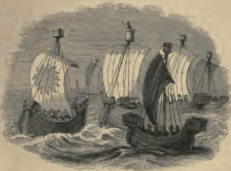
RICHARD II. ON HIS VOYAGE TO IRELAND. Metrical History of Richard II. Harleian MSS.

Thus in the same year were the king, the duke of Lancaster, and the earl of Derby made widowers. There was no talk of the king's marrying again, for he would not hear of it. Although the expeditions to Ireland and Aquitaine were delayed by the queen's death, those lords who were named to go to Ireland did not fail continuing their preparations; and, as their purveyances were ready, they sent them across the sea to Ireland from Brisco* and Lolighet† in Wales; and the conductors were ordered to carry them to a city on the coast of Ireland, called Dimelin‡, which had always been steadily attached to England, and was an archbishopric: the archbishop of which place was with the king.